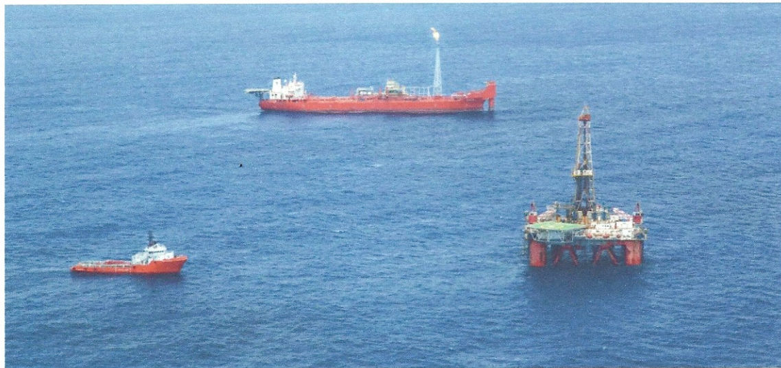
Figure: FPSO Rubicon Intrepid and MODU Ocean Patriot in operations in the Galoc oil field, June 2013